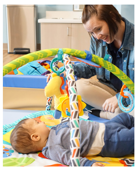
In Spartanburg County, where KRA scores are consistently below the state average, Spartanburg County First Steps is using READY funds to improve the quality of child care in underserved areas.

In its inaugural year, READY funds have enabled First Steps to sustain and expand evidence-based parenting programs, increase the quality of child care, and address pressing workforce and infrastructure challenges.